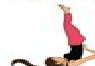
SHOULDER STAND Le Chandelle