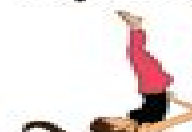
SHOULDER STAND Le Chandelle