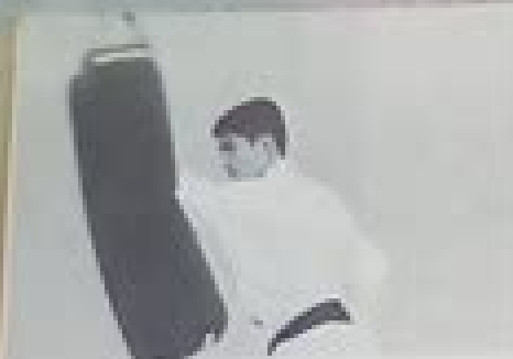
U.S. and Other Countries