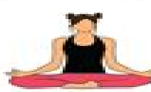
LOTUS Le Lotus