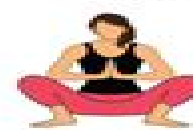
GARLAND La guirlande