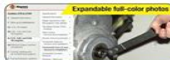
Expandable full-color photos