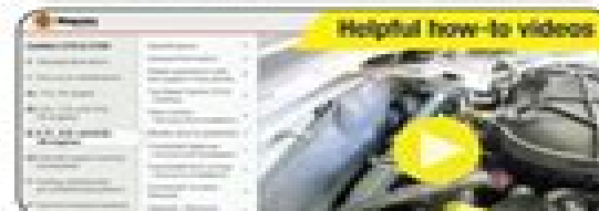
Helpful how-to videos