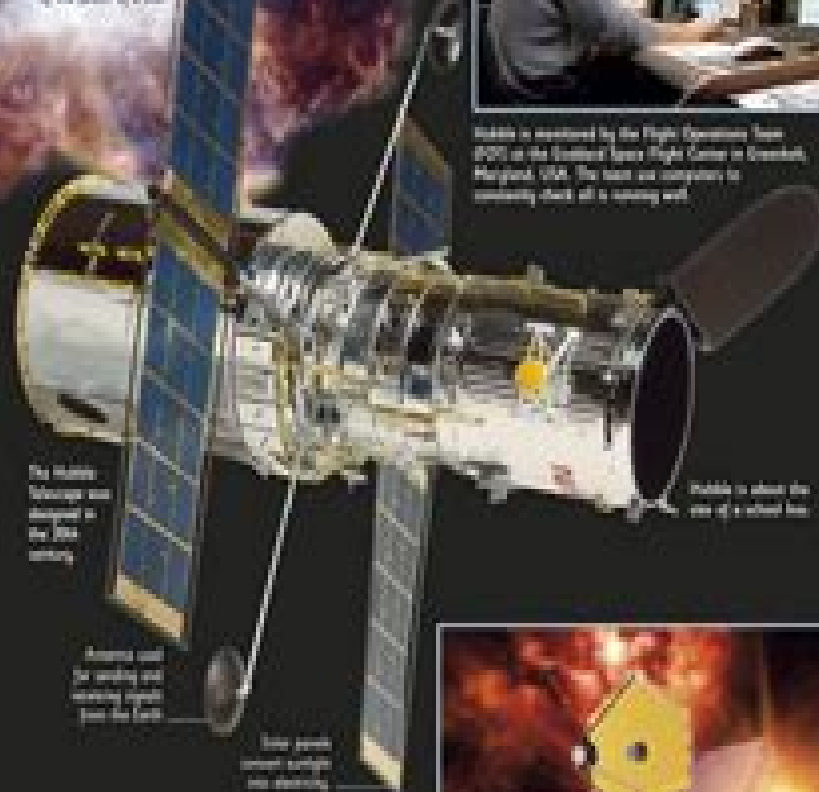
The Hubble Telescope was launched in the 1990s.

Hubble has taken incredibly detailed images, such as this one of the birth of a star.