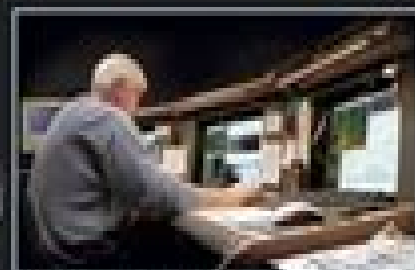
Hubble is serviced by the Flight Operations Team (FOT) at the Goddard Space Flight Center in Greenbelt, Maryland, USA. The team use computers to constantly check all its working well.