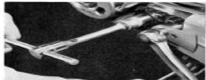
Abb. 8 Abschrauben der Mutter für Kettenritzel

Kunststoffhammer Herausschlagen. Tretkurbeln von der Tretlagerachse abziehen. Die Tretkurbeln selbst sind an ihrem Auge mit „R“ und „L“ gezeichnet, was rechts und links – in Fahrtrichtung gesehen – bedeutet. (Siehe Abb. 9.)